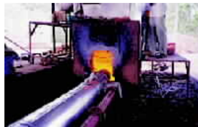
Gasifier with the heating furnace

The gasifier also produces char [20% w/w) of input biomass feed] as a by-product. It can be mixed with a suitable binder like cowdung (15% w/w) to form briquettes using a hand-operated briquetting machine [9]. These briquettes are smokeless and make an excellent fuel for chulhas (traditional cooking stoves). Experiments were carried out to study the potential of this char as a soil conditioner. Various crops were grown on soils treated with different doses of char, without any adverse effects.