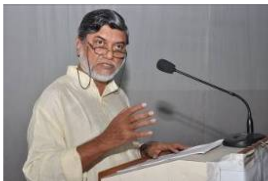
AKR delivering the lecture

http://www.youtube.com/watch?v=P8SiuuHyh8c&feature=related