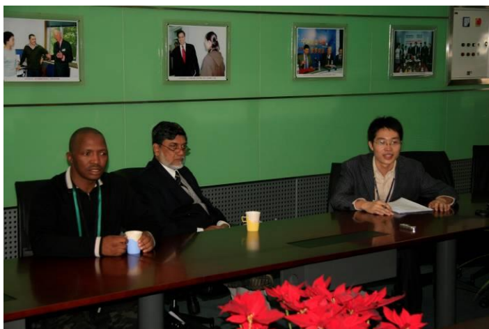
AKR being interviewed by China News Agency